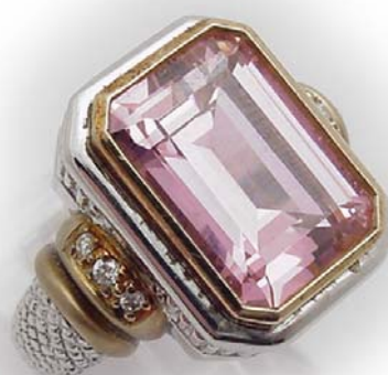
JUDITH RIPKA TWO®

Here is a small sampling of what you will find included in our special pricing: