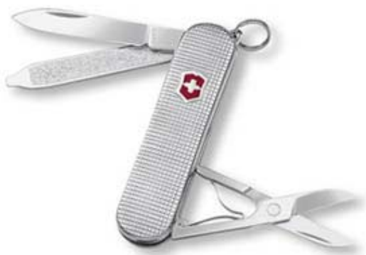
Swiss Army Classic sterling pocket knife. $140