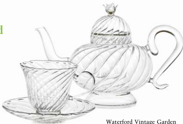
Waterford Vintage Garden Rose Teapot Set. $99

Jay Strongwater frames and Swarovski crystal jewelry also make lasting gifts for mom.