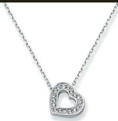
Swarovski heart pendant in clear crystal pavé. $85

Show your Mother how important she is this Mother's Day, May 11th, with something special from Gassers. Let one of our trained sales staff help you find that perfect gift. What better way is there to start then at the